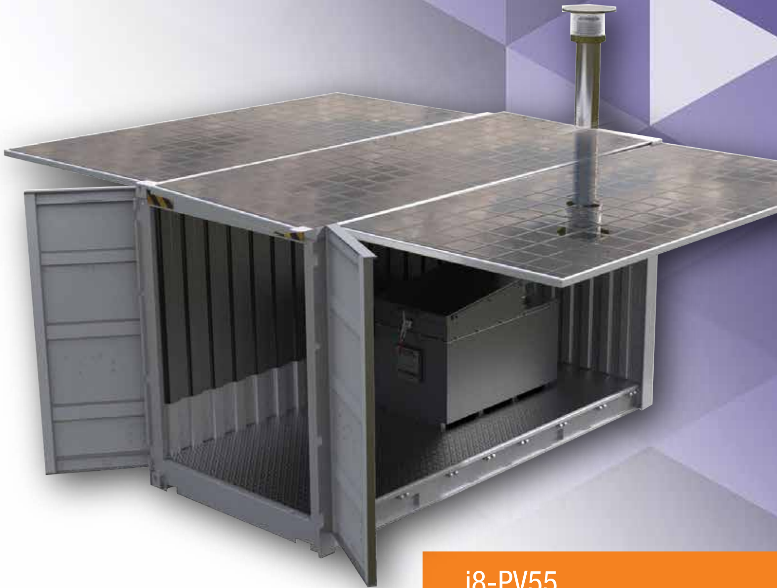
i8-PV55 Solar Incinerator